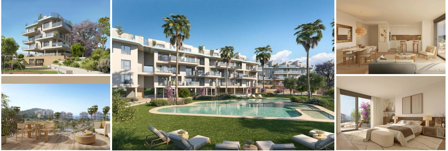
NEW BUILD COMPLEX IN VILLAYOJOSA

New Build residential complex of 42 apartments and penthouses in Villajoyosa located few steps from the beach.