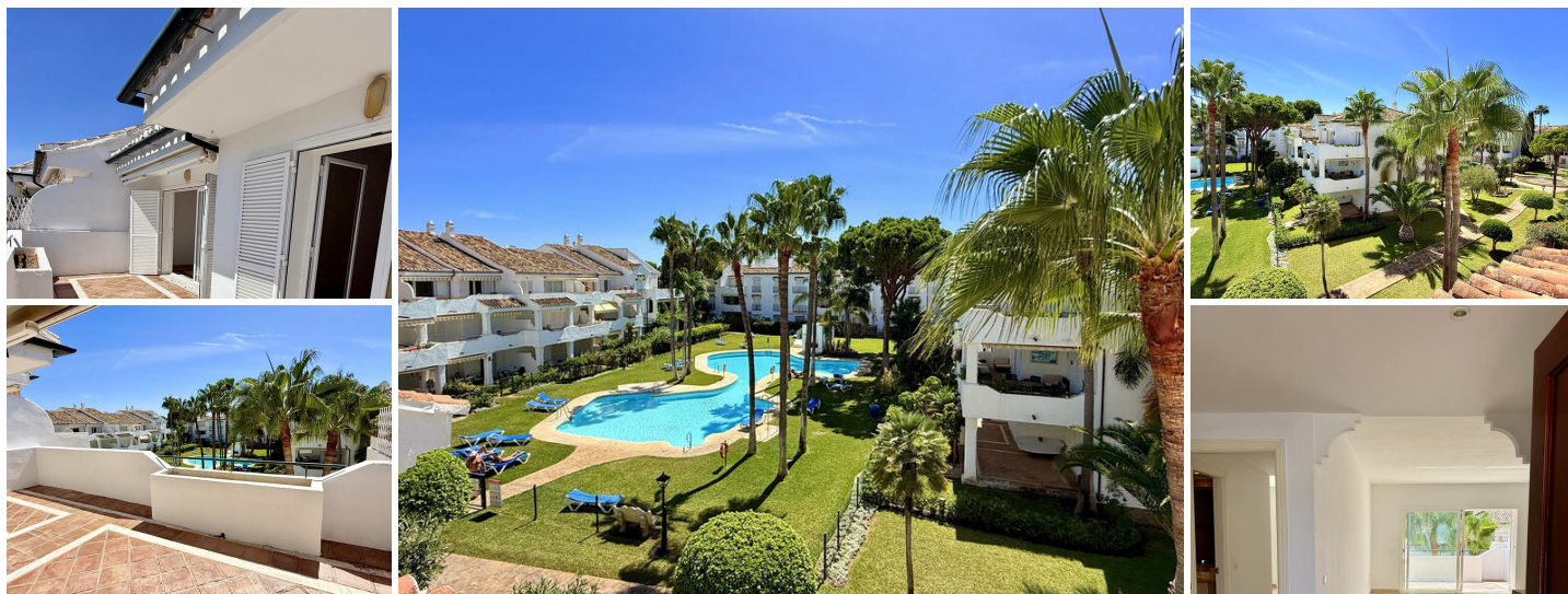
Prestigious EL PRESIDENTE penthouse with lush gardens - NEW GOLDEN MILE / Isdabe

South-facing terrace with open pool view