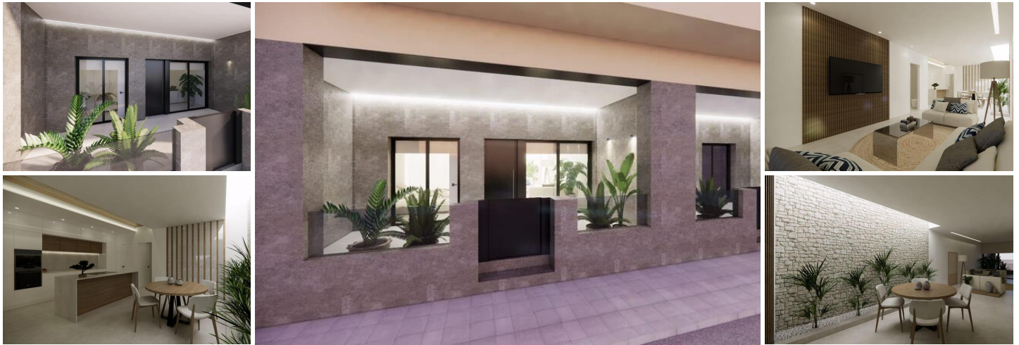
Modern Apartments of New Construction in Catral