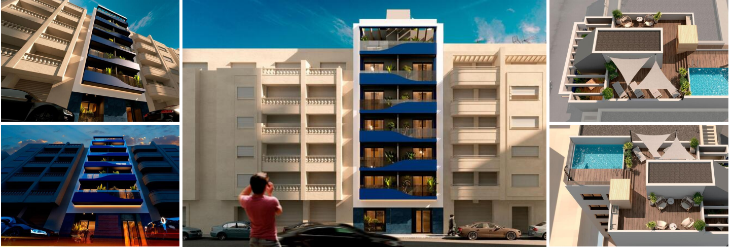
New Build Apartments 200 Metres from the Sea in Torrevieja