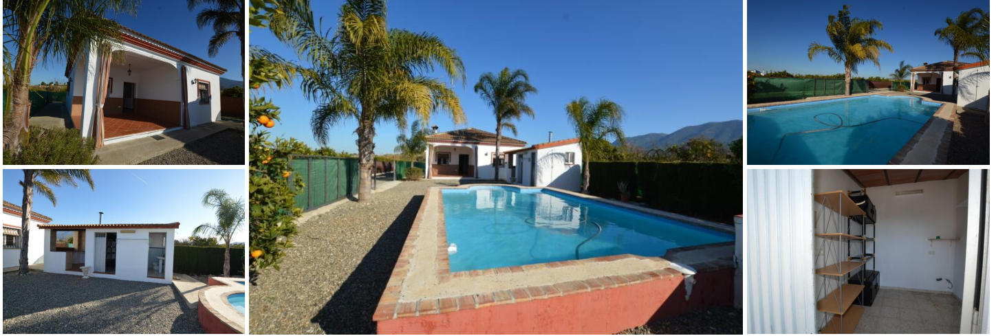
Charming Rural Chalet with Pool and Barbecue Area

This lovely chalet is set in a peaceful rural location surrounded by fruit trees, offering complete privacy and a relaxing atmosphere. The property features a swimming pool, a fully equipped barbecue area, and ample parking space for several vehicles, with easy access via a paved road.