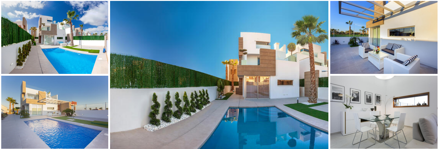
Detached Villa with Large plot and Private Pool in El Raso