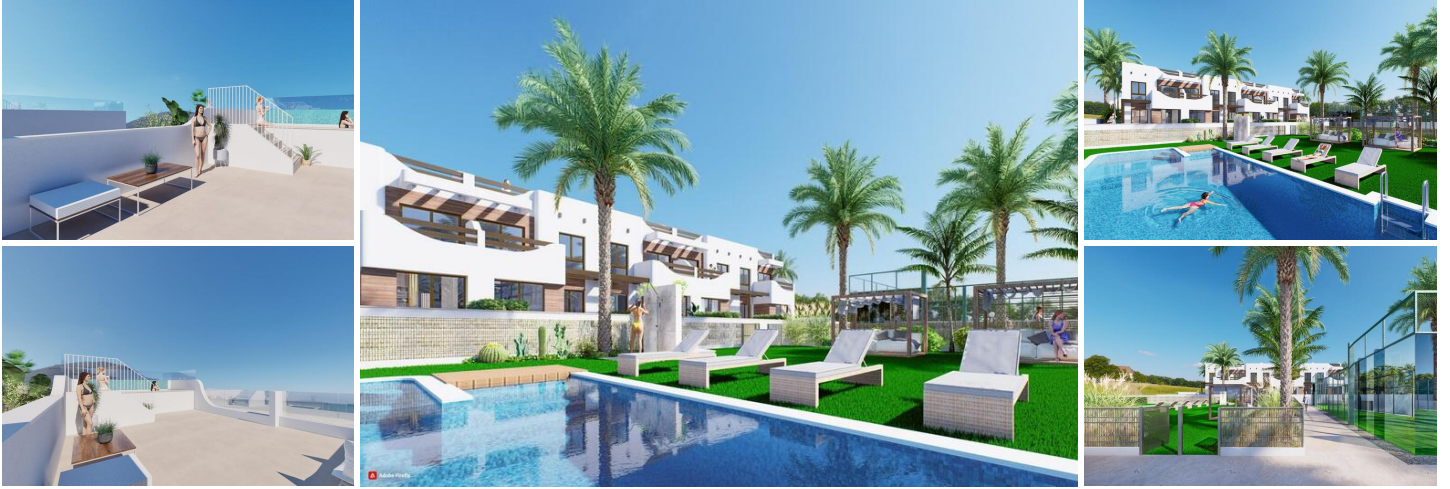
Modern Living Steps from Las Higuercas Beach in Torre de la Horadada