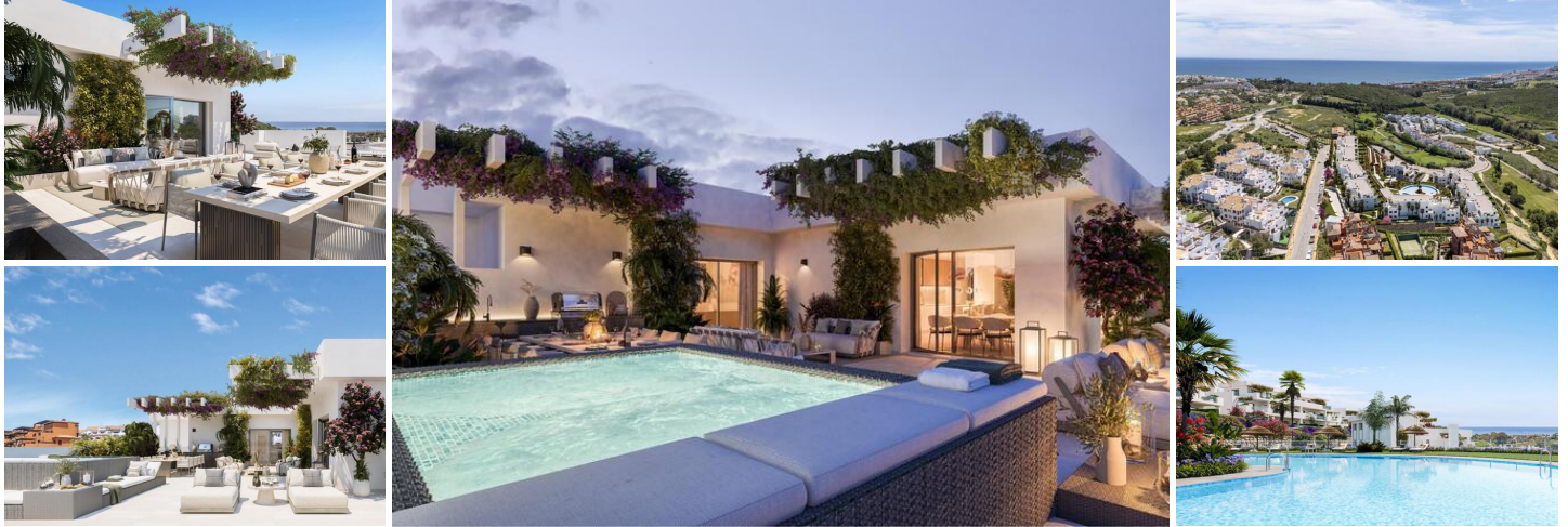
Luxury Golf Resort Living in Casares, Costa del Sol

Experience an exceptional lifestyle at this exclusive residential resort located on the front line of Casares Costa Golf, a serene oasis with only 74 apartments and 17 penthouses. With 2 and 3-bedroom units, this low-density development offers a peaceful environment and stunning views of the golf course, Mediterranean Sea, and surrounding mountains.