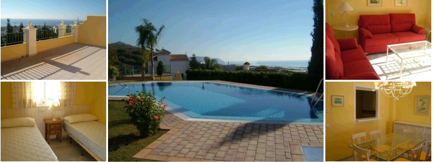
Apartment For Sale In Nerja

South facing apartment in the outskirts of Nerja town, it enjoys pleasant views to the garden, pool, sea, hills, trees, village and town.