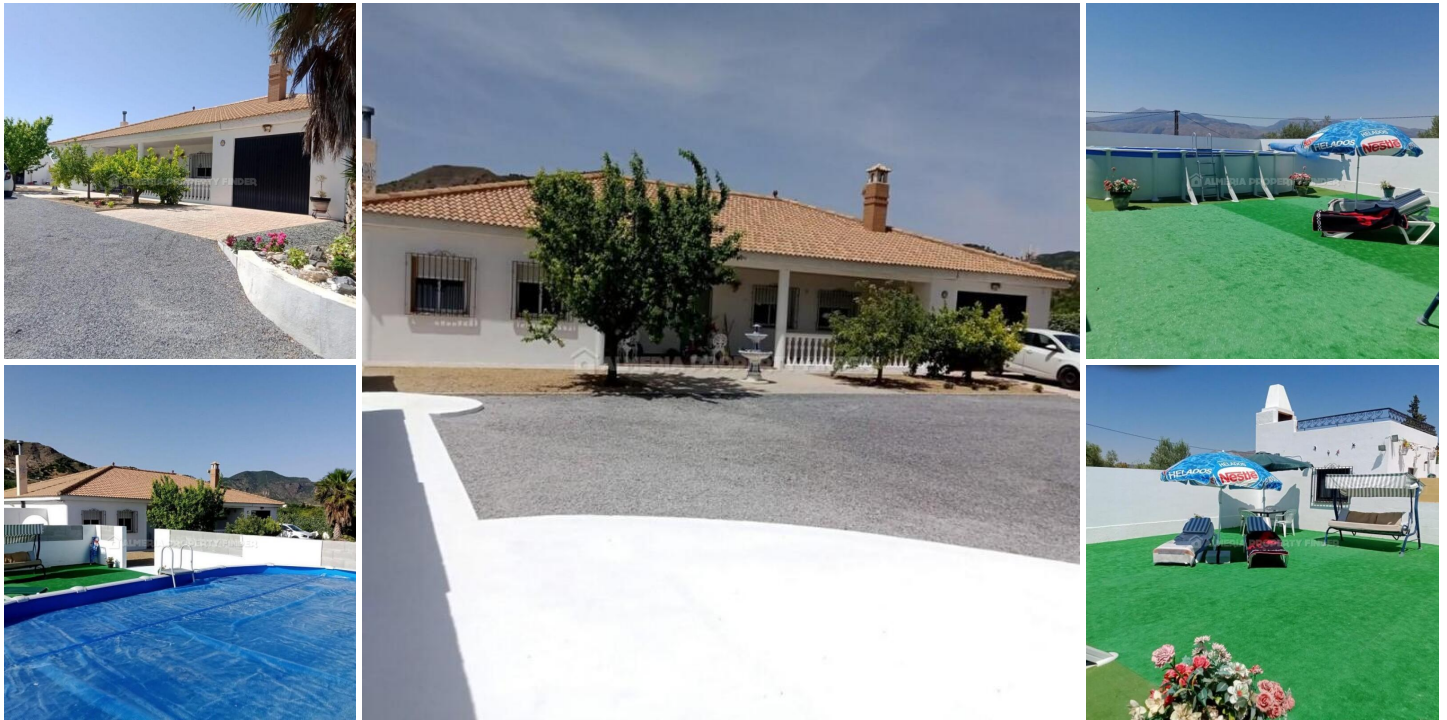
Villa Vista a la Montana - A villa in the Somontin area. (Resale)

This charming three bedroom, 2 bathroom villa is set in a large fully fenced and walled plot with double gates opening out onto the ample parking area, which also includes a good size garage and landscaped garden surrounded by the stunning views of the mountain ranges.