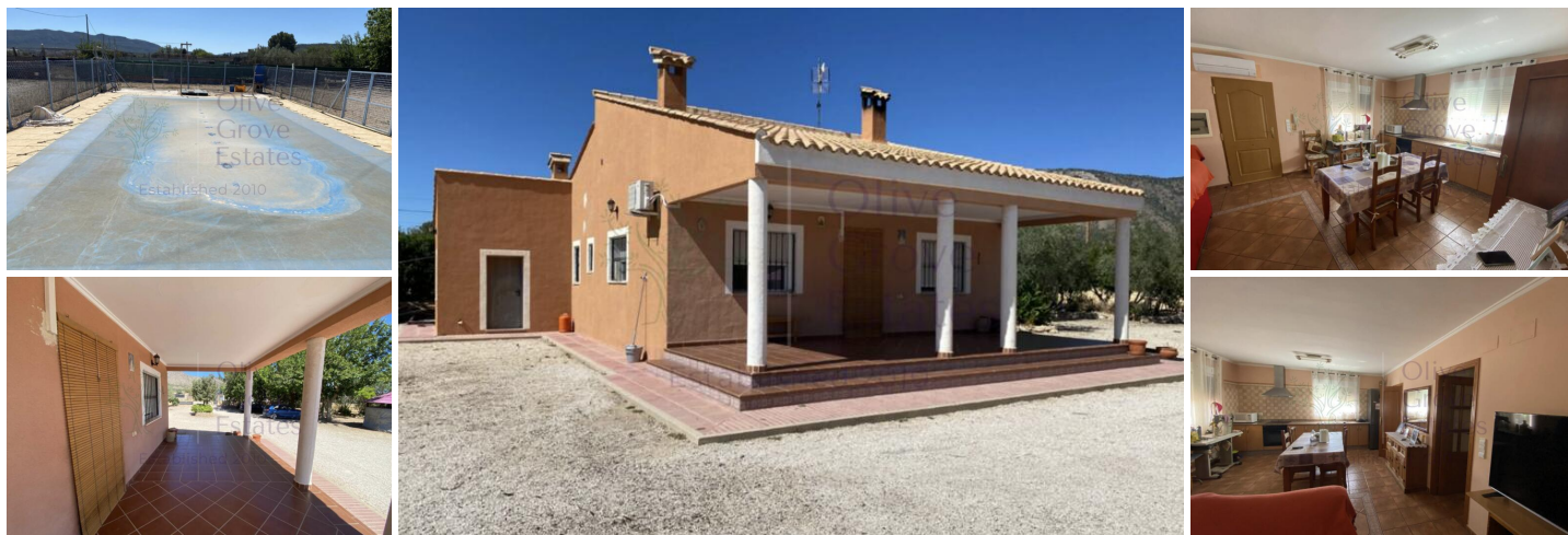
Fabulous 3 Bed 1 Bath Villa in Salinas with Pool and Orchard

First of all, location, location, location. Could hardly be better, a villa in the countryside with breathtaking views yet only a ten minute walk into the town and with tarmac road access all the way.