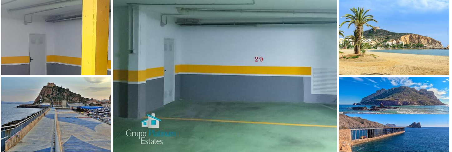
Garage and storage room for sale in Avd. Isla del Fraile, Águilas

The property has a total surface of 39 m 2 , offering more than enough space both to park your vehicle comfortably and to safely store belongings in the adjoining storage room.