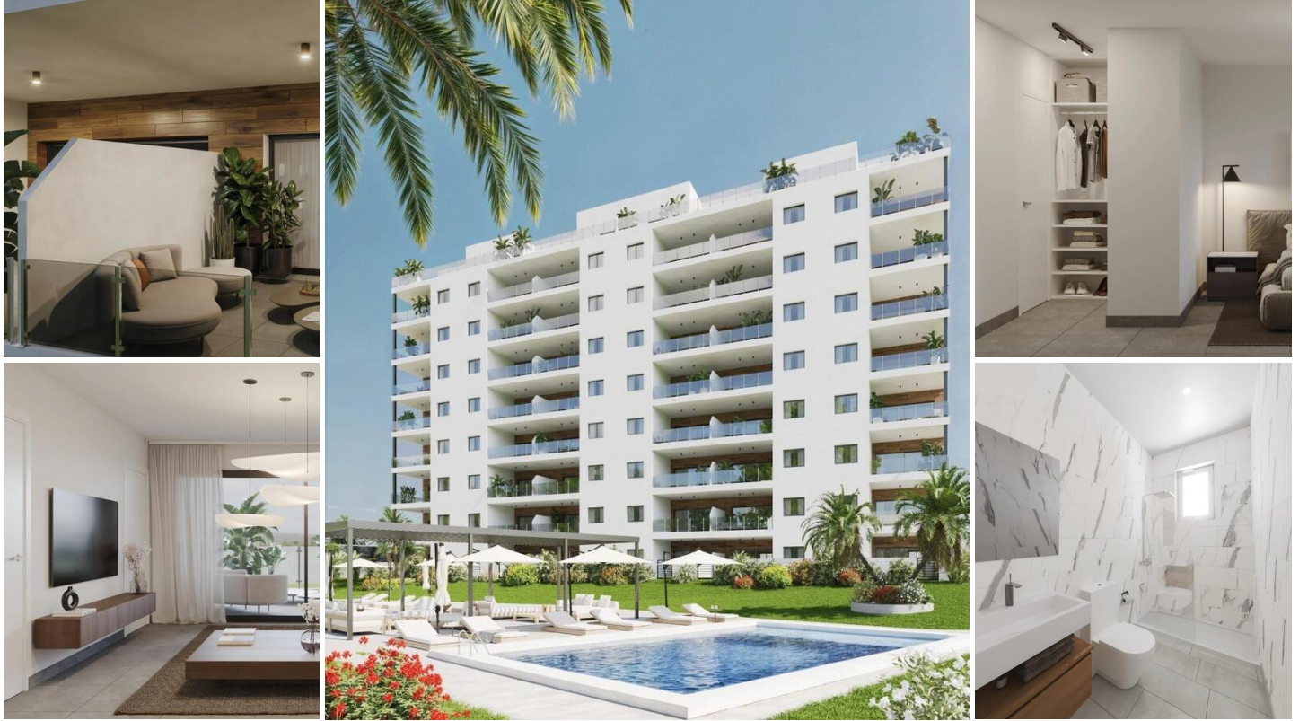
New Build Apartments in Cala Finestrat, Villajoyosa