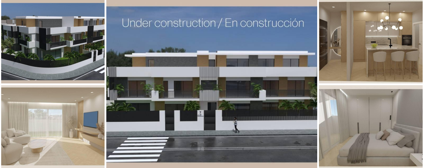
Apartment complex under construction in Jávea

This small-scale project, consisting of only 9 apartments, is currently being built in a prime location for those who like to live within walking distance of all amenities. The building is located on the edge of the historic centre of Jávea, just 1 km from the beach and the harbour.