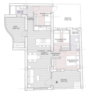
PLANTA I ID SPT. UNO INTERIOR COMUNICACION: SUELO - COCINA - BAÑO