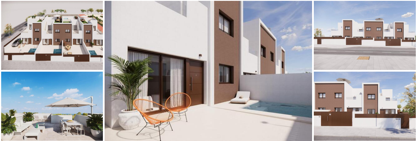
Modern New Build Villas with Optional Private Pool in Pilar de la Horadada