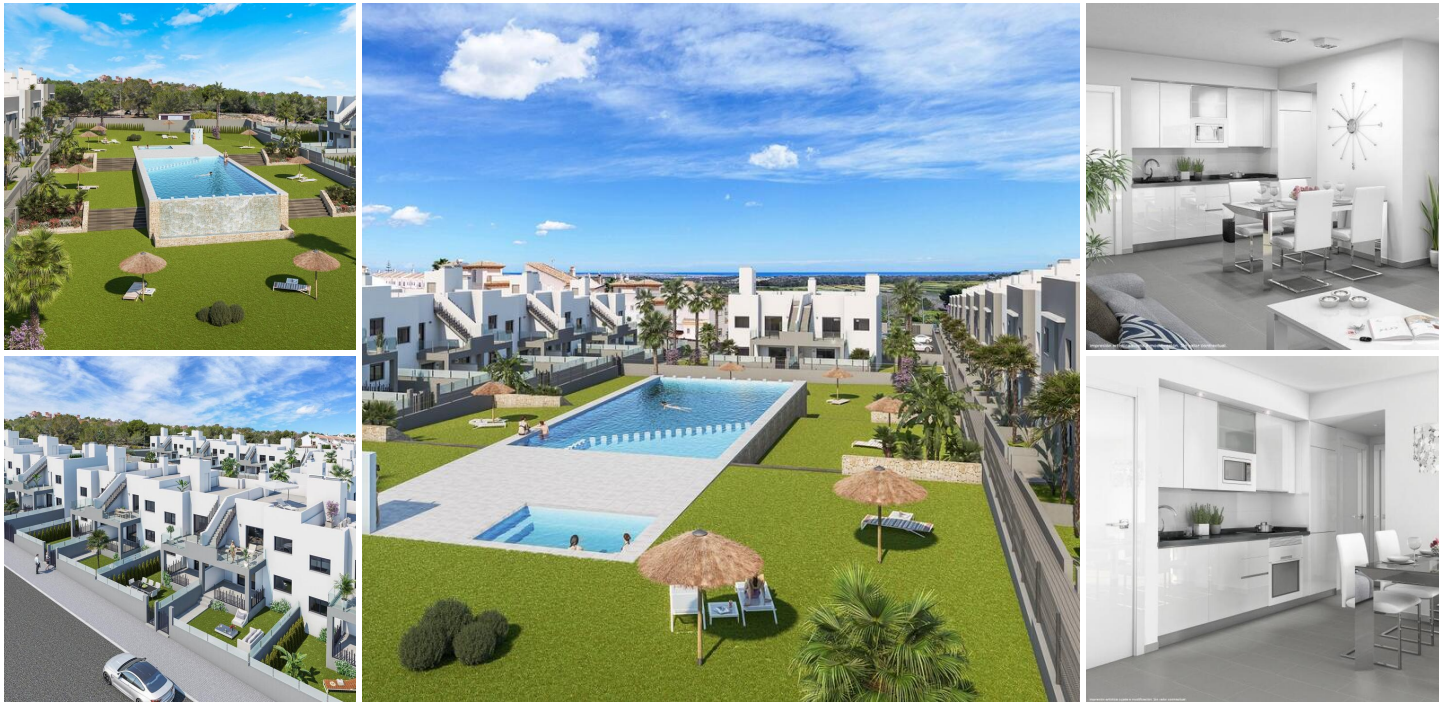
New Build Bungalows in San Miguel de Salinas – Nature, Golf and Comfort

Discover this new residential development in San Miguel de Salinas, located in the sought-after area of “La Cañada”, surrounded by a protected pine forest between the prestigious golf courses of Campoamor and Las Colinas. Just 7 km from the Mediterranean coast, this residential offers the perfect blend of tranquility, nature, and easy access to all amenities.