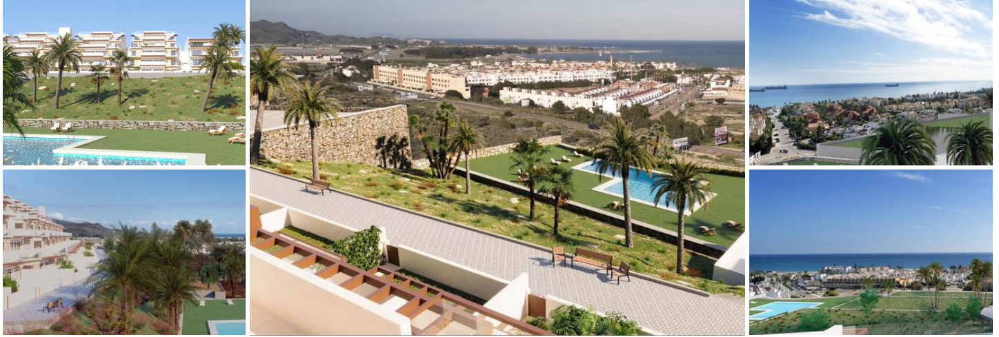
New Build Apartments with Sea Views in Vera Playa, Almería

Discover this exceptional new residential development in Vera Playa, offering 27 modern apartments in its first phase. Designed to combine comfort, functionality, and spectacular Mediterranean views, this project is ideal for those seeking a home on the Costa de Almería with style and convenience.