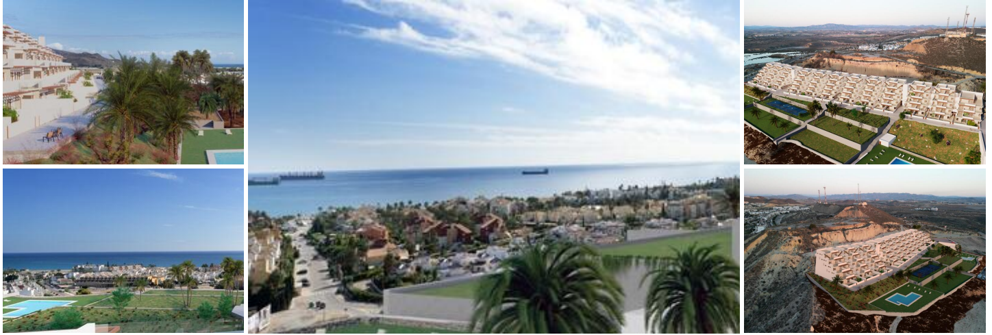
New Build Apartments with Sea Views in Vera Playa, Almería

Discover this exceptional new residential development in Vera Playa, offering 27 modern apartments in its first phase. Designed to combine comfort, functionality, and spectacular Mediterranean views, this project is ideal for those seeking a home on the Costa de Almería with style and convenience.