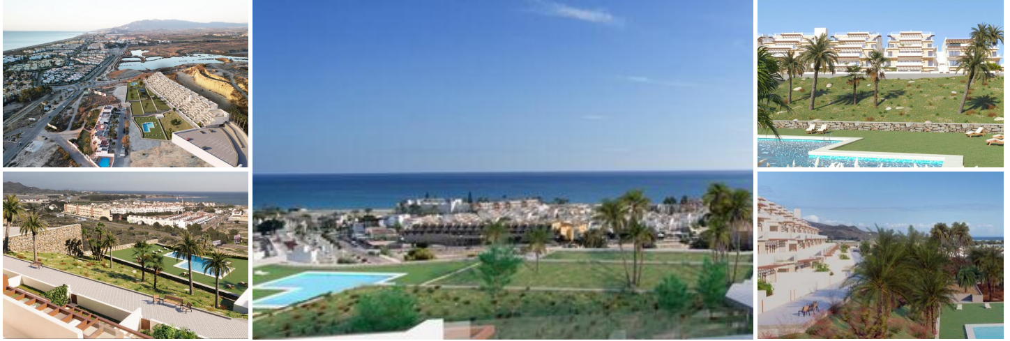
New Build Apartments with Sea Views in Vera Playa, Almería

Discover this exceptional new residential development in Vera Playa, offering 27 modern apartments in its first phase. Designed to combine comfort, functionality, and spectacular Mediterranean views, this project is ideal for those seeking a home on the Costa de Almería with style and convenience.