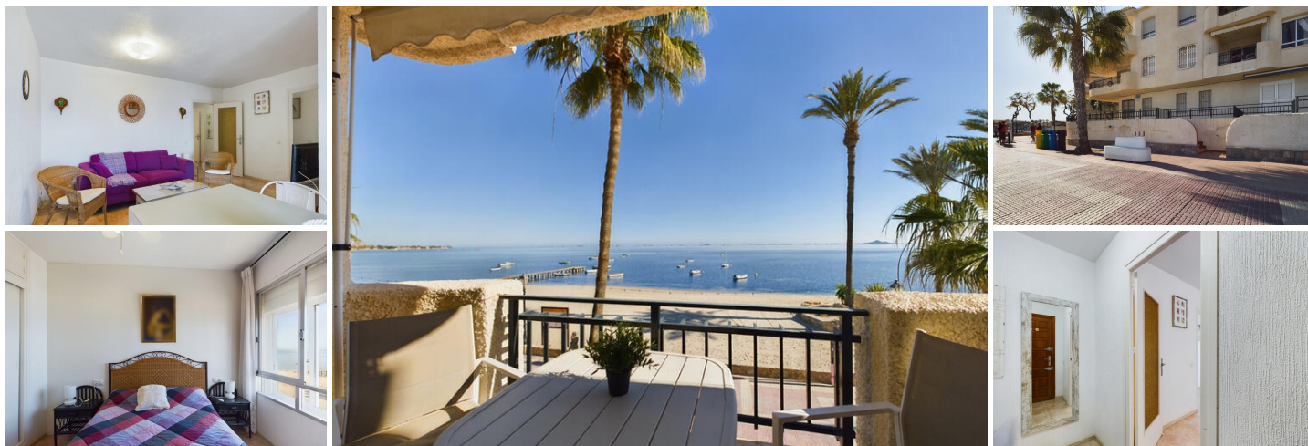
Elegant Frontline Apartment with Exceptional Views

This 3-bedroom, 2-bathroom apartment is a rare opportunity to enjoy a stunning coastal lifestyle.