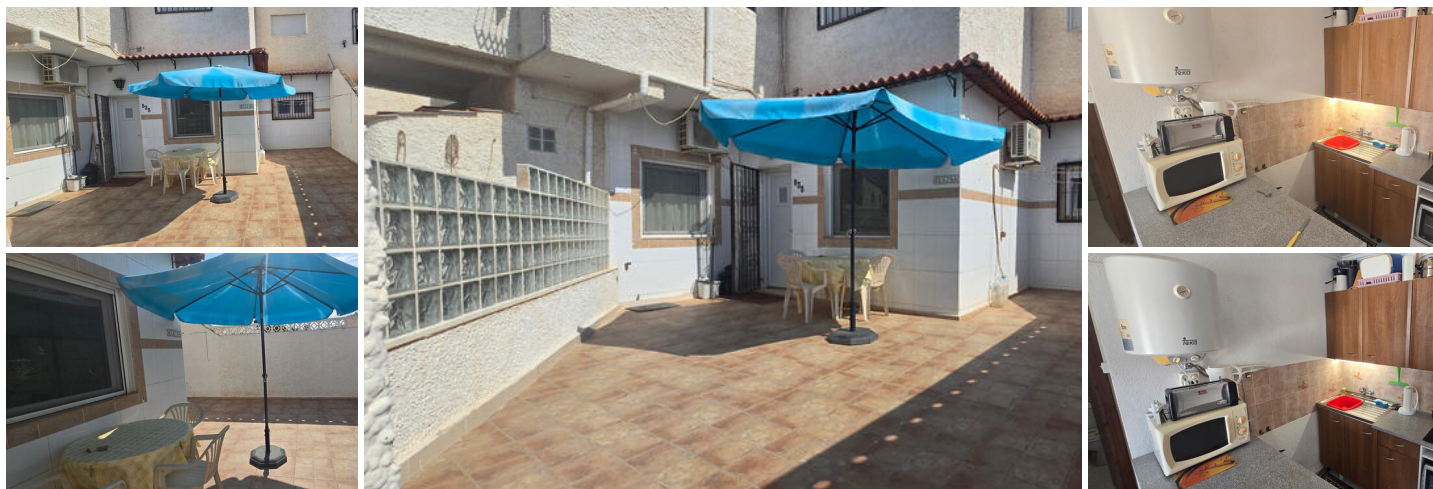
2 Bedroom ground floor

Terraced bungalow for sale in La Torreta close to the Habaneras shopping centre, Torrevieja and La Mata.