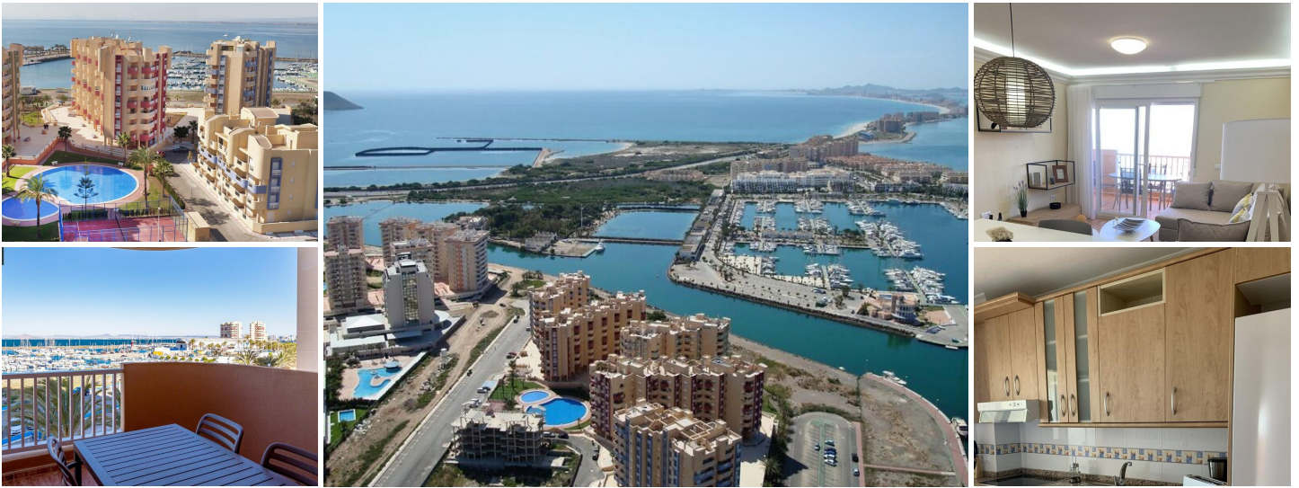
BEAUTIFUL SEA VIEW APARTMENTS IN LA MANGA

This urbanization is located in the largest expansion area of La Manga.