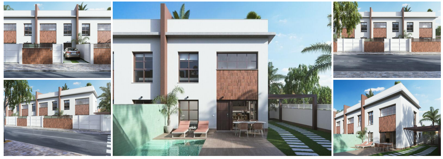
BEAUTIFUL NEW BUILD TOWNHOUSES IN PILAR DE LA HORADADA

New Build Residencial in Pilar de la Horadada consists of 4 exclusive duplexes designed in industrial style, with noble materials such as iron and concrete.