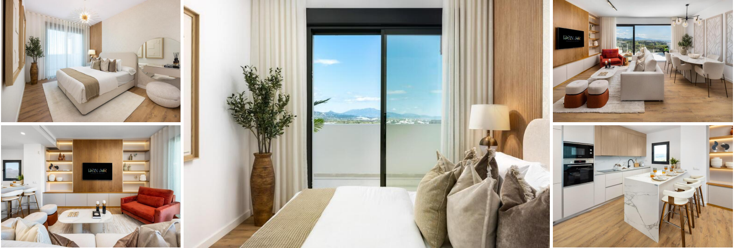
Luxury Apartment with Panoramic Views in Finca Cortesín, Casares

Exclusive 3-bedroom, 2-bathroom apartment with guest toilet, located within one of the most prestigious resorts on the Costa del Sol — Finca Cortesín. With stunning sea and mountain views, this property offers a perfect combination of luxury, comfort, and prime location.