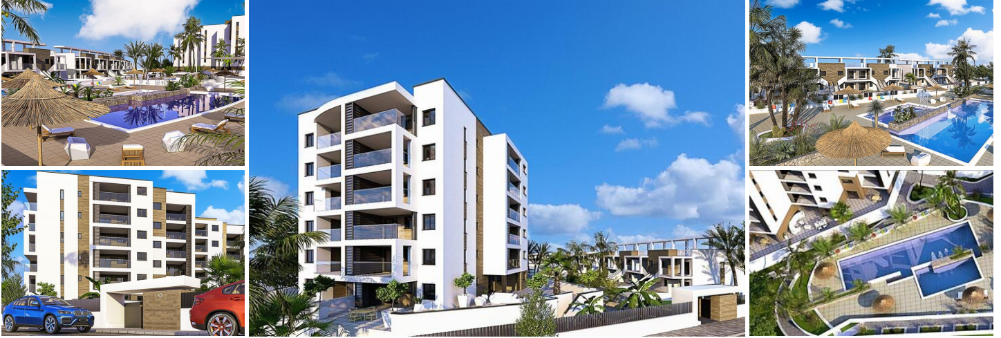
New Build Apartments and Bungalows in Mil Palmeras