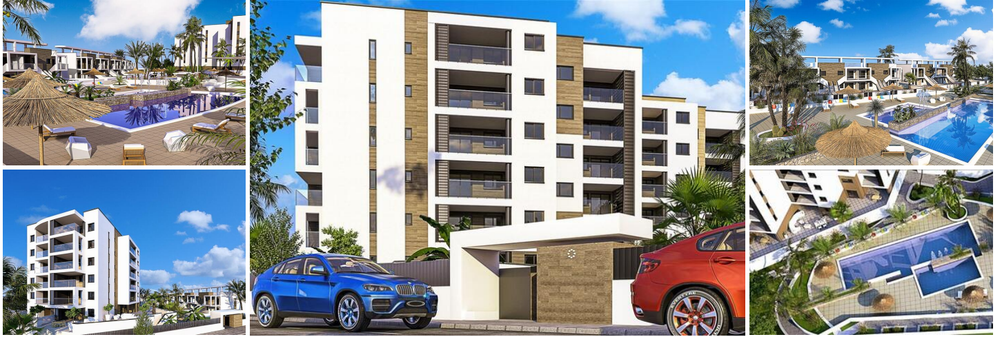
New Build Apartments and Bungalows in Mil Palmeras