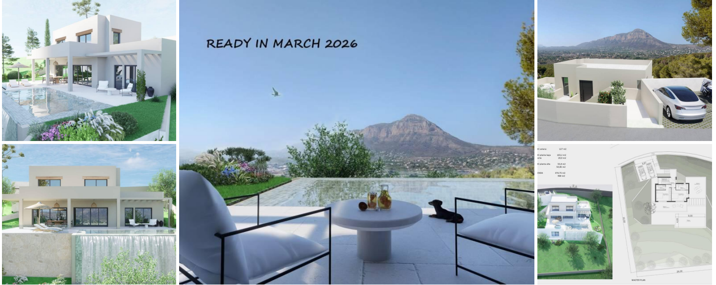
New build villa for sale in Rafalet, Jávea

This villa will be ready by March 2026 (subject to change) and is located in the Rafalet urbanisation 3 km from Jávea beach.