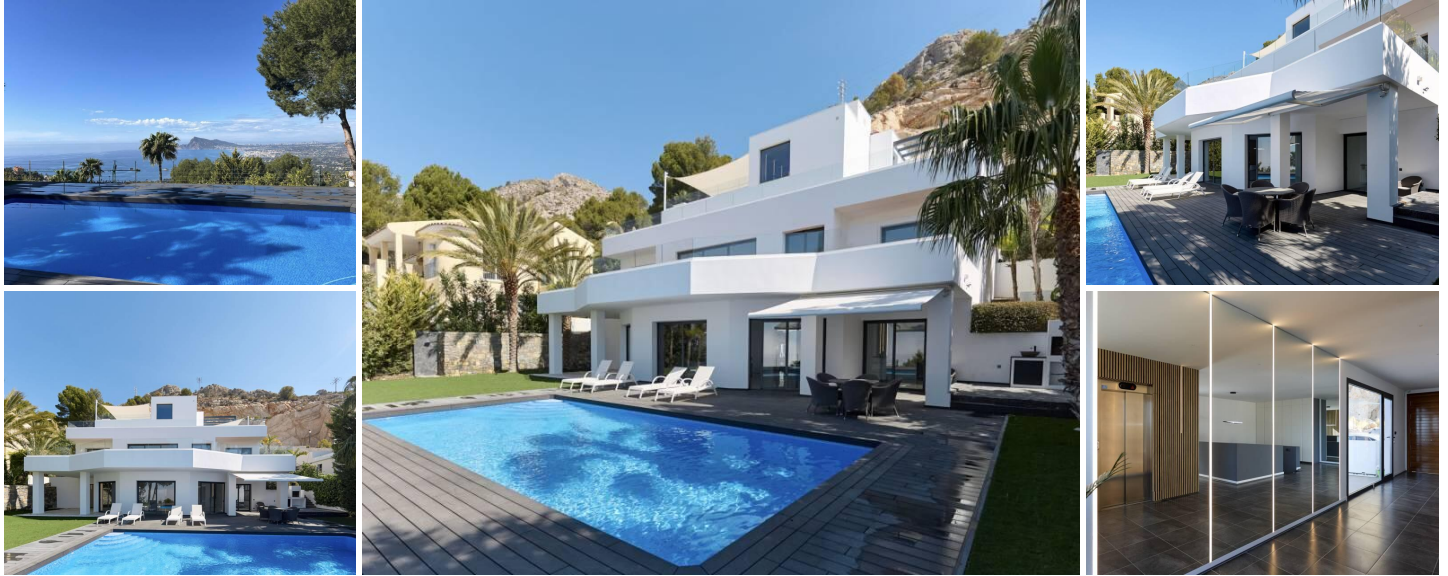
Luxury villa with breathtaking sea views in Altea Hills

Located in prestigious Altea Hills, this exclusive villa offers a living area of no less than 475 m 2 , spread over three floors. One of the floors has been specially designed as a guest house, ensuring comfort and privacy for all. In total, the villa has 5 spacious bedrooms and 7 modern bathrooms. On the 913 m 2 plot you will find both open parking for two cars and an enclosed garage for one car, equipped with a charging station for electric vehicles.