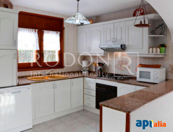
House in Miami-Playa

Finally you have found house in excellent condition, focused on investors Tarragona, Mont-roig del Camp, Miami Platja, for only € 340,000.