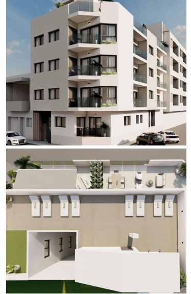
Modern New Build Apartments in Guardamar del Segura Near the Beach