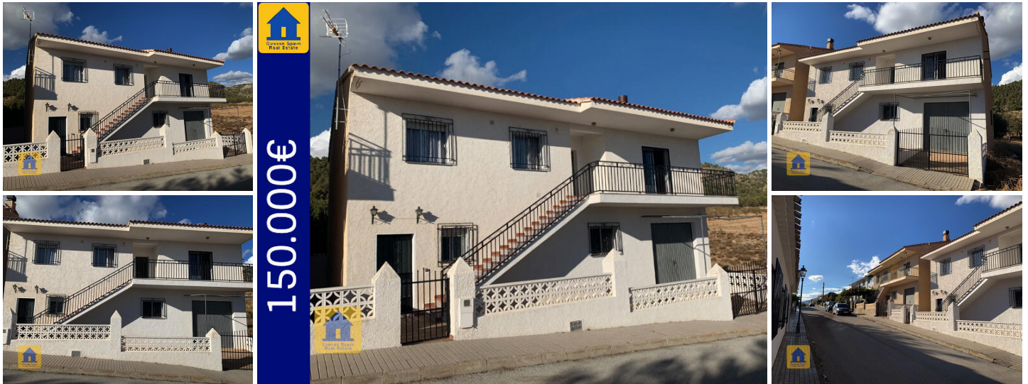
Casa Marina in Fatima

This is a nicely designed, spacious, detached house with good views, ready to move into. The house has two units, one on each floor. The property sits at the foot of the mountains of the Sierras de Cazorla, Segura y Las Villas, in Fatima, a hamlet of the beautiful town of Castril in the Province of Granada. It is a perfect place to enjoy the peace and beauty of nature. Fatima has basic shops and two excellent restaurants.