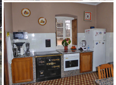
Detached house in Asturias

Large detached family home for sale near Salas in Asturias. This five bedroom property is located in a small village between Cornellana and Salas and is ready to move into. The property is in very good condition throughout, just a little painting required in places. This imposing house also comes with a 6125 square metre plot of land with some mature trees, a panera, a large open barn, additional storeroom, garage, some disused cattle stalls and a small house to restore. This is a lot of property for the price. There is also an additional hectare of land available to buy for 24,000€ if anyone is interested in purchasing more. It's located just a short walk from the edge of the village and follows the river Nonaya.