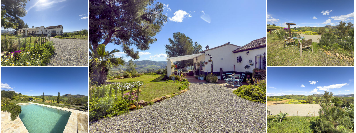
Equestrian Property with Breathtaking Mountain Views – Alora/Pizarra Area

Nestled in the picturesque countryside near Alora and Pizarra, this equestrian property offers a unique blend of comfort, functionality, and natural beauty. Set on approximately 20,000m 2 of fenced land, the estate is ideal for horse lovers, boasting stables, a schooling arena, and direct access to fantastic riding trails.