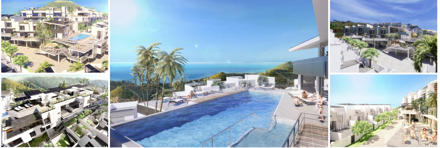
El Mirador - an architectural pearl in the Costa del Sol

Only 2 units remaining as of April 2023!