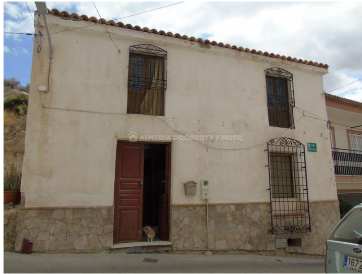
Casa Bodega - A town house in the Zurgena area. (Partially Reformed)

This large partly renovated 6 bedroom, 4 bathroom townhouse with a build of 300m 2 courtyard garden is for sale in situated in the old part of the small town of Zurgena, within easy walking distance of the town's amenities. Zurgena is a traditional Spanish village where the general hustle and bussle of village life is centered around the village square and it's bars which all serve tapas long into the evening. Other facilities include a kiddies' play park the newly constructed sports barn, 2 mini-markets, a bakers, 2 banks and two convenience stores.