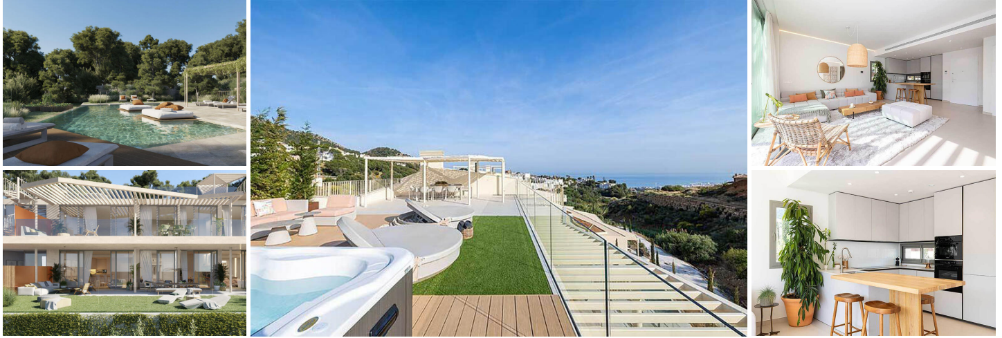
Duplex Penthouse - Sea and Nature Views - Mijas

A peaceful haven between the sea and nature, with incredible views of the valley and the Mediterranean Sea. This apartment offers the perfect combination of serenity and modernity, all just 10 minutes from the beach. Ideally located near shops and services, this unique property invites you to enjoy a relaxed lifestyle.