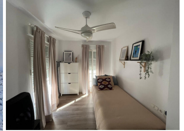
Charming Townhouse in Benalmádena