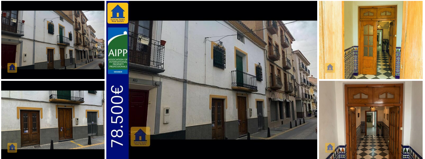
Casa Maria en Huéscar

This historical townhouse is situated in the heart of Huéscar. The house is full of character with large, spacious rooms. The house has 2 floors with an attic and a small basement. Each floor is a separate unit with its own bathroom, kitchen and patio/terrace.