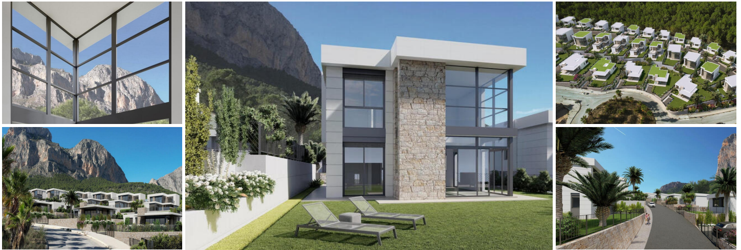
New Construction Villas in Polop, Alicante