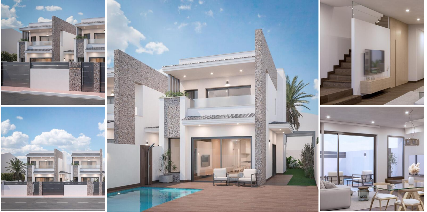
Luxury Villas in San Pedro del Pinatar - Modern Living in a Prime Location