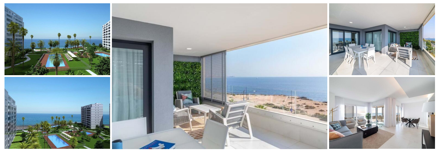
HOUSING IN FIRST LINE OF SEA

in Punta Prima, Torrevieja, with exclusive views of the sea and the beach.