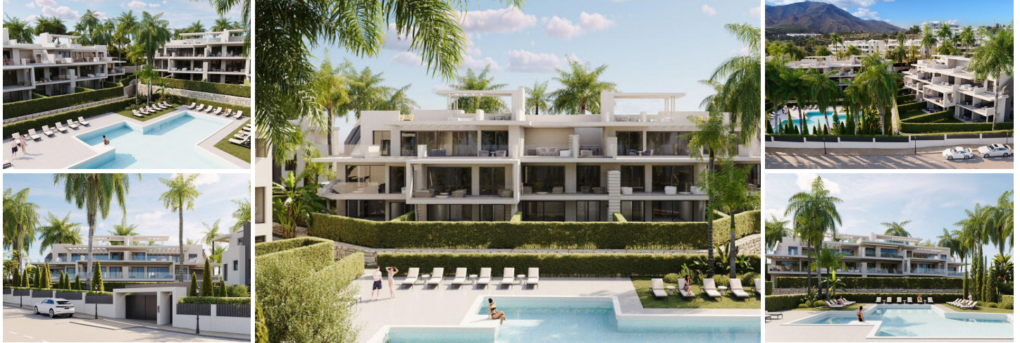
"Luxury Apartments for Sale in Estepona

Discover Sunway Residence Estepona: an exclusive new development featuring 48 apartments and penthouses with two and three bedrooms, located within walking distance of the beach and local amenities in the beautiful area of Arroyo Enmedio in Estepona on the Costa del Sol.