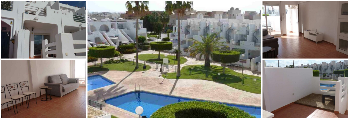
Charming Duplex with Sea Views in Palomares Village

Medalmar is proud to present this beautifully maintained 2-bedroom, 2-bathroom duplex located in a highly sought-after development in the tranquil village of Palomares. Perfect for those seeking comfort and convenience, this spacious property comes with multiple terraces offering stunning views of the sea and surrounding countryside, making it the ideal spot for relaxing or entertaining.