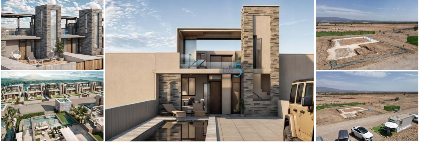
NEW BUILD TOWNHOUSES IN FUENTE ALAMO, MURCIA

New Build residential of villas and townhouses in in Fuente Álamo, Murcia.