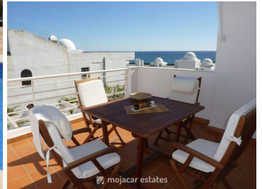
Lance Nuevo Raf

Fantastic top floor apartment for 4 people in a residential complex in sea frontline position with easy access from main road via a lift.