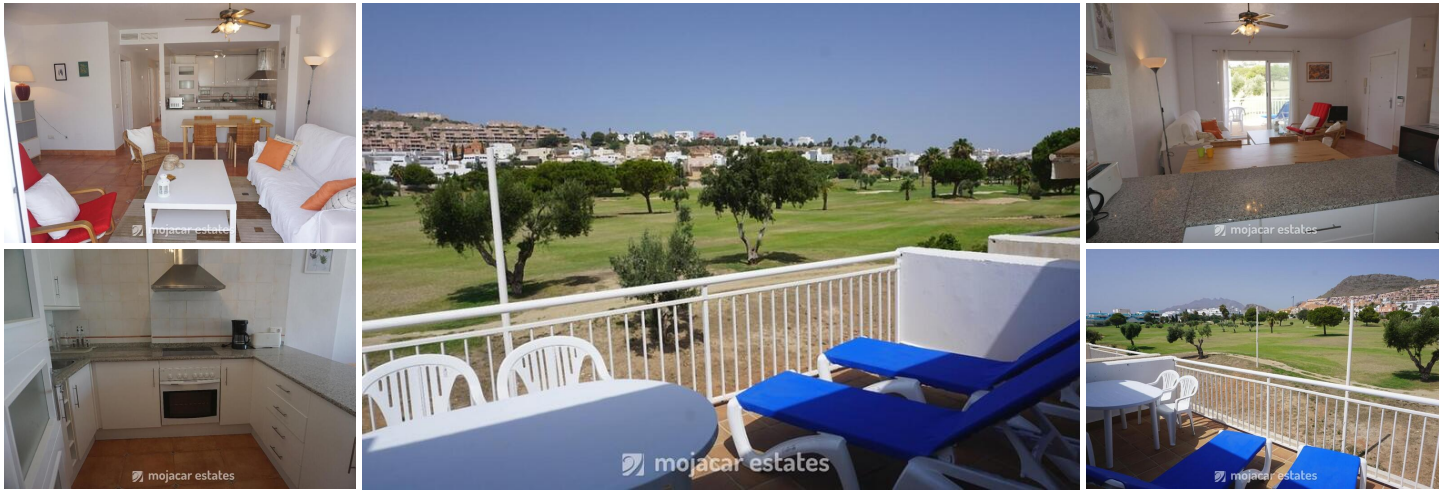
Marina Golf Ness

Top floor apartment for 4 people conveniently located between golf & beach with wonderful golf course views.