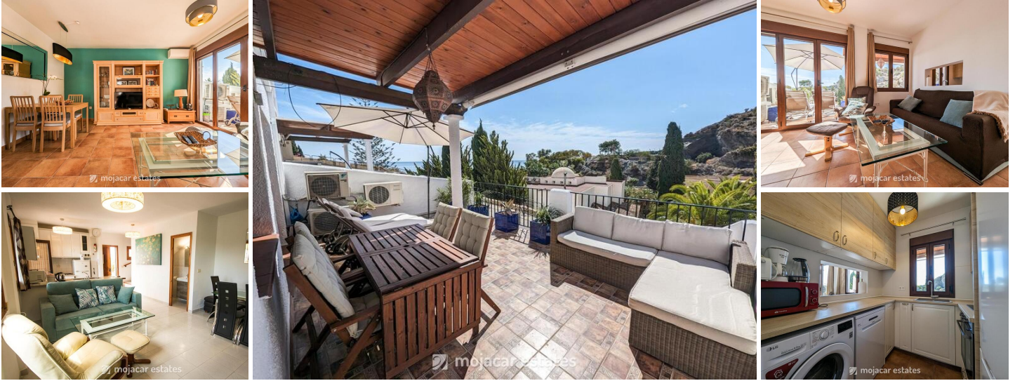
Balcones del mar Juli

Welcome to your perfect vacation destination in the sunny south end of Mojácar! This newly renovated holiday home promises an unforgettable experience for up to four guests. With two levels of modern living space, a communal pool, and sea views, it's the perfect escape for families or couples seeking relaxation and tranquility.