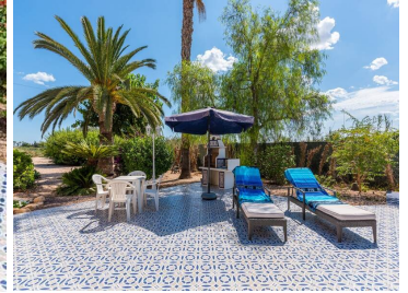
Finca in Daya Vieja