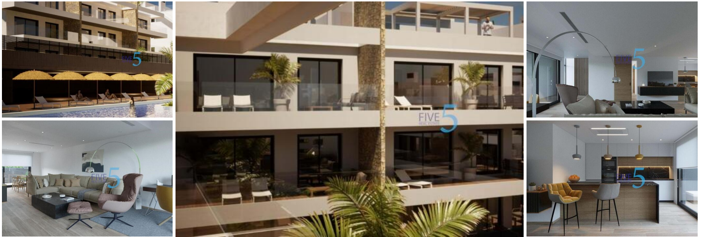
NEW BUILD RESIDENTIAL COMPLEX WITH THE SEA VIEW IN FINESTRAT

New Build Residential complex with the sea views in Finestrat.